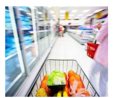
If your product is in this cart, there's a good chance we helped it get there.