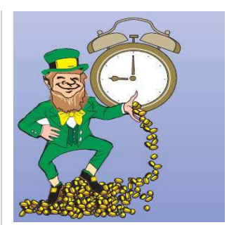
A wee bit o' Success for ya thar Laddies and Lassies!

We would like to thank all of our customers and new business associates that came by the Multi-Conveyor booth at the recent Converting Influence Expo at Lambeau Field in Green Bay on March 7th. Besides showcasing our latest designs for non-wovens, paper and print conveying, these events are excellent avenues to exchange ideas and industry trends with our colleagues and customers. Your feedback is important to us and we welcome suggestions on how we can make our products even better with your input. E-mail us today and let us know how we can help you with your next project.